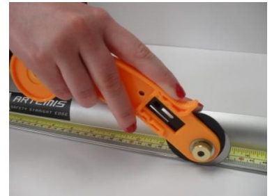
Using a rotary cutter