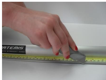
Using a utility knife